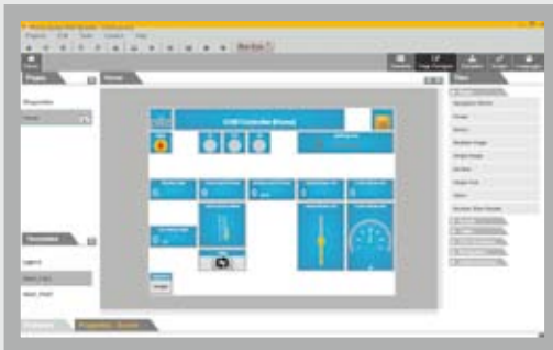
PASvisu blue style