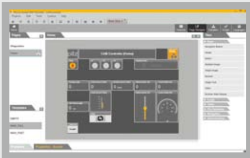
PASvisu glass style

You can change the appearance across the project with a single click. Your project always looks like it's from one source. What's more, minimum effort is needed to make subsequent changes or customise the project.