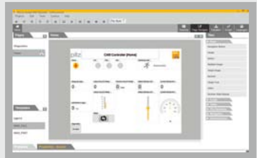
PASvisu pilz style

Select various style specifications with a single click.