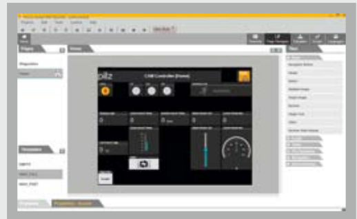
PASvisu dark style